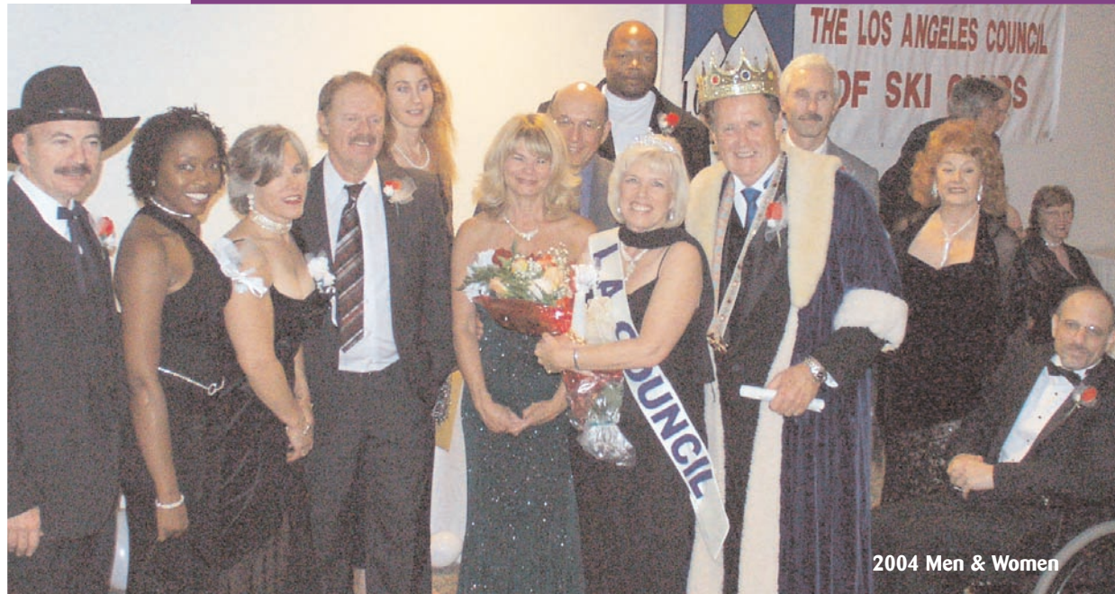
2004 Men & Women