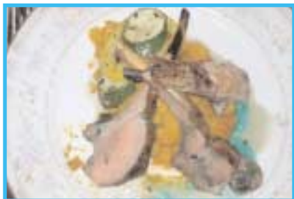
Lamb with Yams & Squash

Chocolate Bunt Cake topped with Chocolate Ganache & Whipped Cream