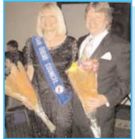
San Diego Council Man & Woman of the Year

This past November, both LA and San Diego Councils hosted their annual Snow and Winter Galas. Besides being a great way to kick off the ski season, both councils honored their Men and Woman of the Year who will represent their respective councils at the Far West Convention in Santa Clara, June 1-2, 2007. Congratulations & Good Luck.