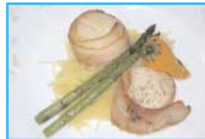
Scallops & Asparagus atop Spaghetti Squash