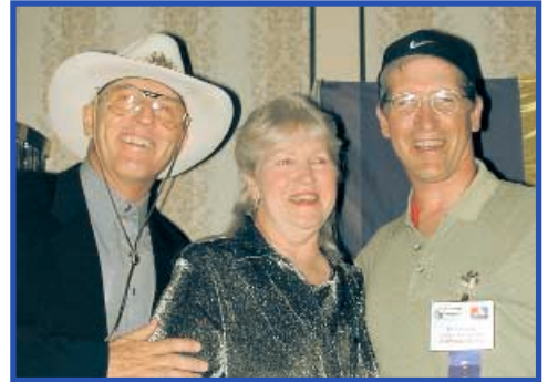
Billy Kidd, Bill Johnson's Mom's, Bill Johnson—