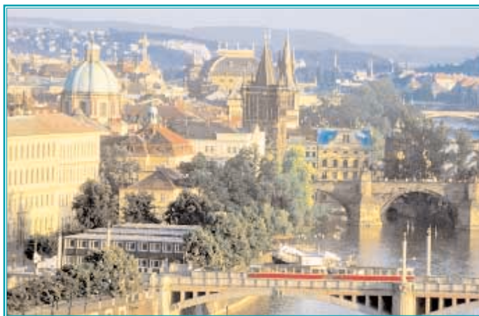
Wenceslas Square, Center of Prague

Jewish burial ground which attests to Prague's historically numerous Jewish residents, almost all of whom perished in the Holocaust.